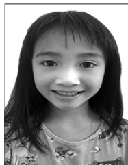
Anita Yang Forest Park Elementary Fremont CA