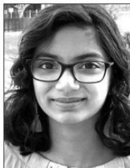
Ishana Padmanabhan Forest Park Elementary Fremont CA