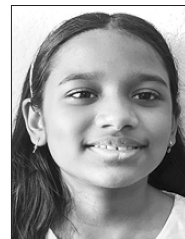
Saarvi Ingole Forest Park Elementary Fremont CA